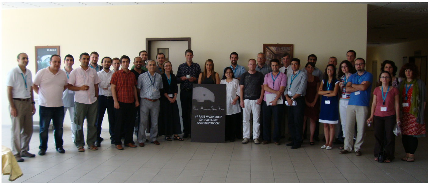
Participants and lecturers of the FASE Basic Workshop on Forensic Anthropology