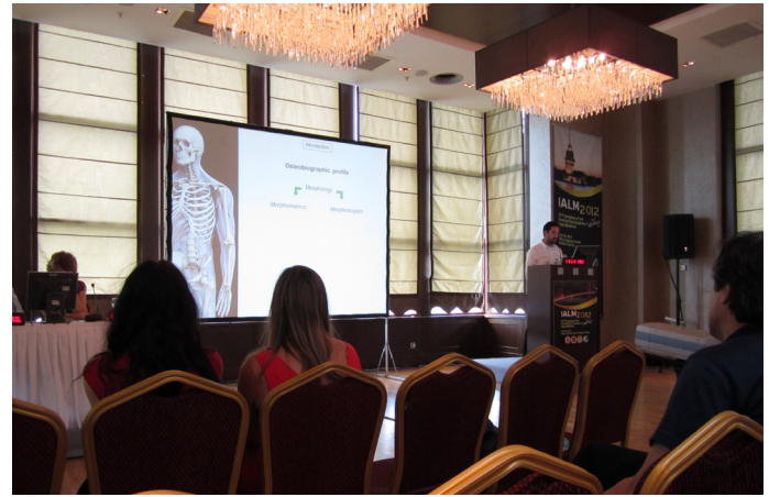
The Forensic Anthropology oral session at the 22 nd IALM Congress

Even though the Assembly was a bit rushed due to the tight schedule of the meeting, it was well attended and the most important issues were satisfactorily addressed.