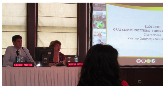
Opening of the Forensic Anthropology Session

Following the session, FASE members and interested scientists