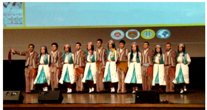
From the opening ceremony of the 22nd IALM Congress- Istanbul 2012

These critical comments are not meant to diminish the great efforts put into the organization of the event and its ultimate success, but will hopefully serve as a suggestion in order to improve the communication between scientists and the quality of future meetings .