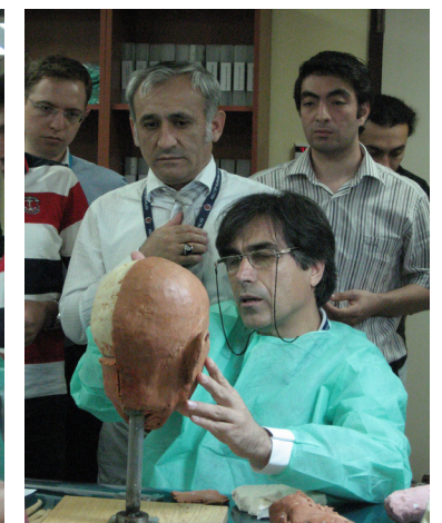
The theoretical and practical sessions of the 6 th FASE Workshop on Forensic Anthropology